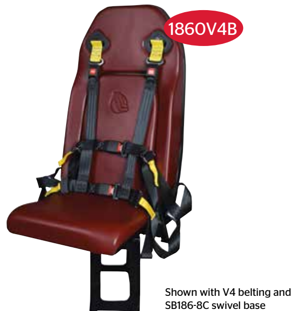
Shown with V4 belting and SB186-8C swivel base