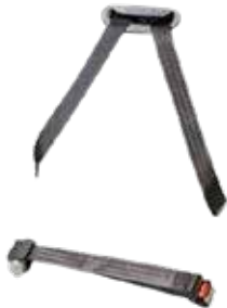
Back Pack Belt