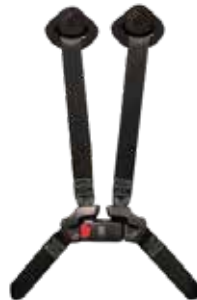
IMMI 4-pt. Belt