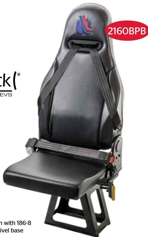
shown with 186-8 swivel base