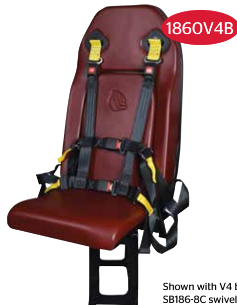
Shown with V4 belting and SB186-8C swivel base