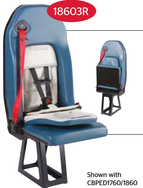
Shown with CBPED1760/1860

FMVSS, European and ADR Certified – ECE R14, R44 and R16