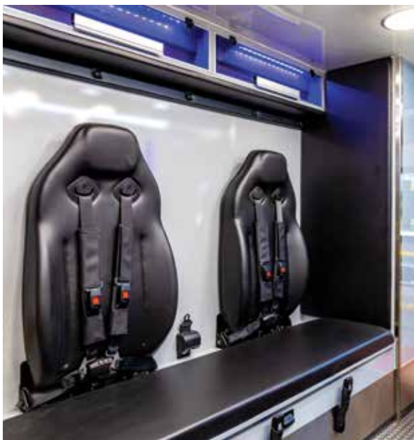
Vinyl Cushions and Headers